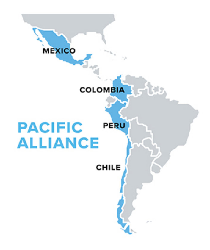
Map showing the Pacific Alliance countries of Mexico, Chile, Colombia and Peru