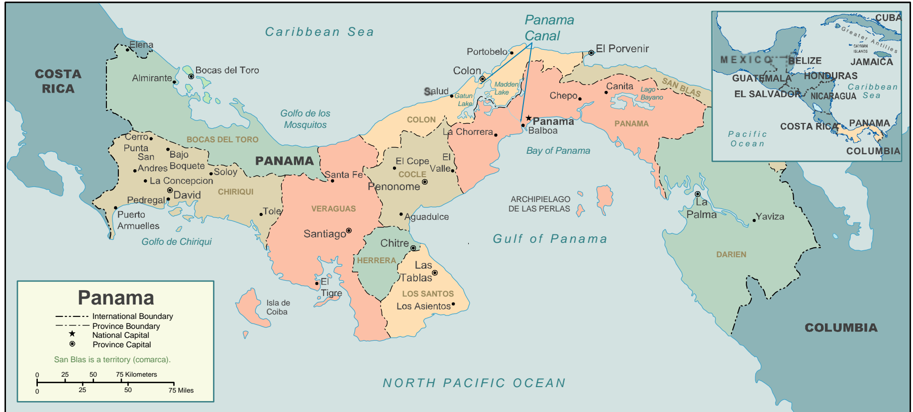
Figure 1. Map of Panama